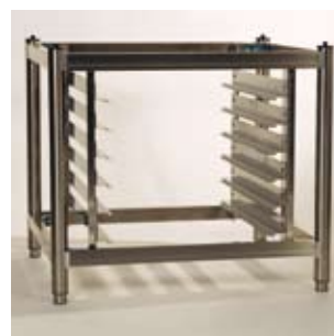
SUP900 + 950